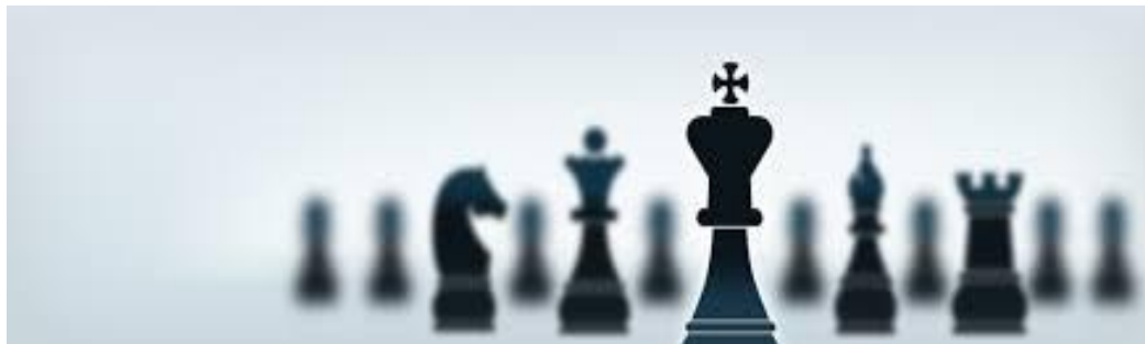
Figure 4. The act of headship

Risk oriented thinking: The person must have strong knowledge and culture the improvements of actions. He can sustain in the world by satisfying their clients.