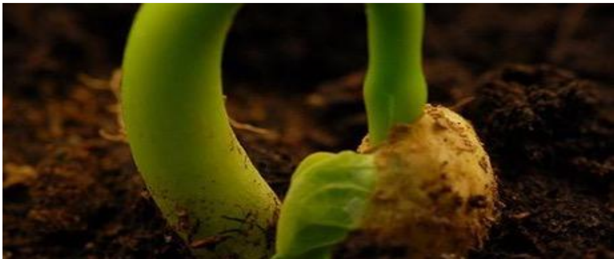
Figure 1. Vigorous mental effort

Really, it’s not possible to monitor every thought we have. A study attributes about human thought tell us that we have about sixty thousand thoughts a day. Can you just imagine how fatigued you would feel trying to control all the sixty thousand thoughts? Providentially, we have an easier way. That’s our feelings.